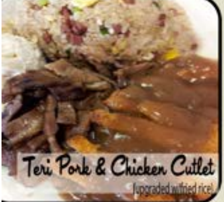
Teri Pork & Chicken Cutlet (upgraded w/fried rice)