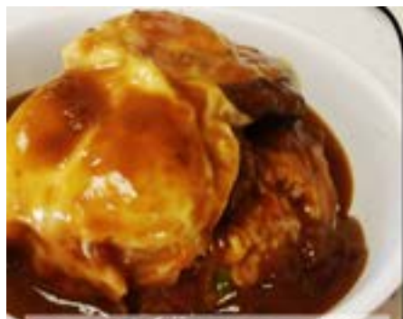
Double Fried Rice Loco