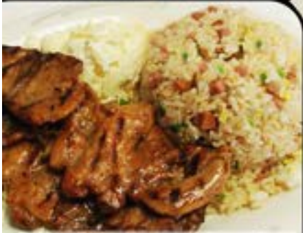
Yakitori Chicken & Fried Rice (upgraded w/fried rice)