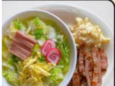
Saimin & Teri Pork Combo