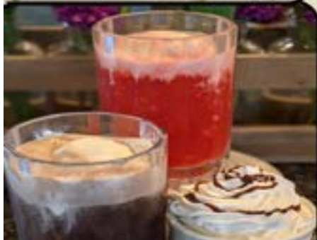
Floats & Hot Chocolate