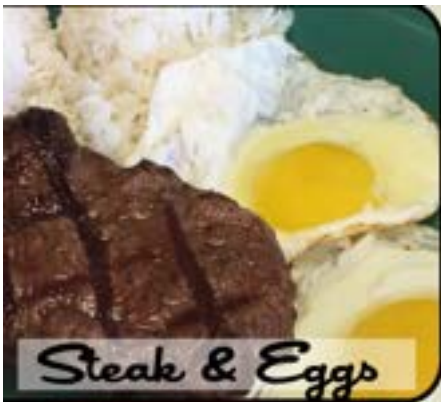
Steak & Eggs