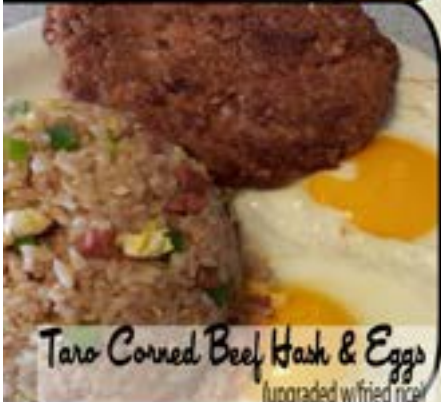
Taro Corned Beef Hash & Eggs (upgraded w/ fried rice)