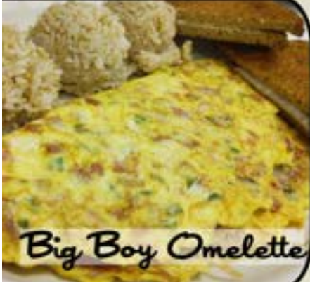
Big Boy Omelette