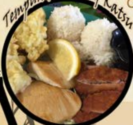
Tempura w/ Fish & Katsu

Upgrade to a Half Order of KG Fried Rice for Just $4.75 more, in Place of Rice