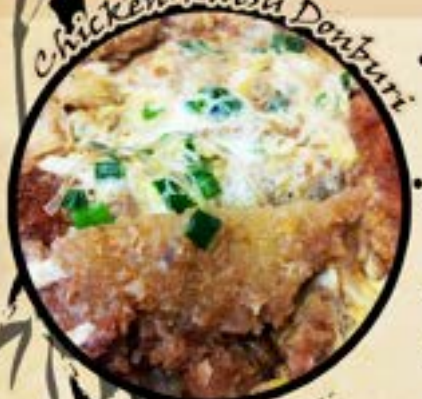
Chicken Katsu Donburi