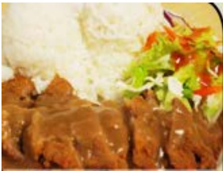
Fresh Pork Cutlet

Mini Plates available on * Entrees for $2.00 less