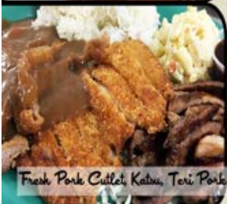
Fresh Pork Cutlet, Katsu, Teri Pork