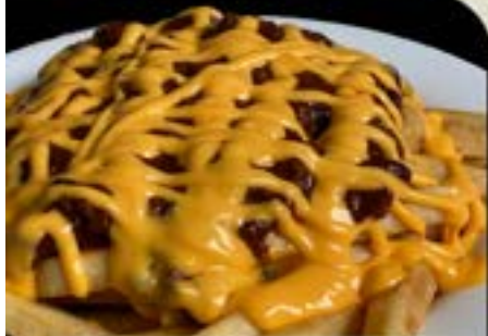
Chili Cheese Fries