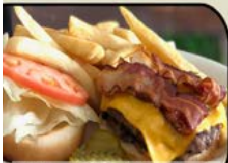
Mushroom & Bacon Cheeseburger