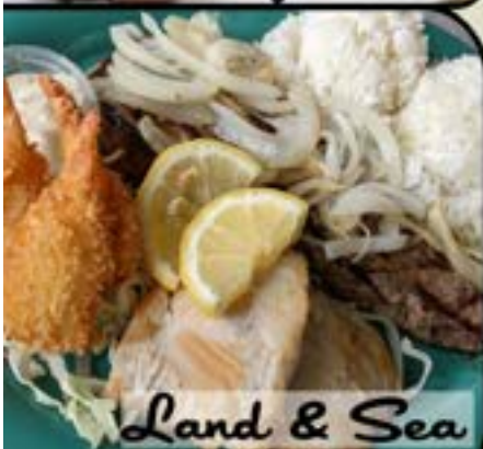
Land & Sea