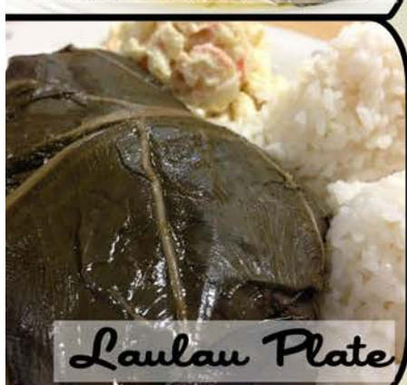
Lau Lau Plate