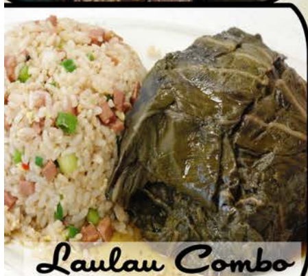
Lau Lau Combo