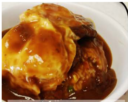
Double Fried Rice Loco