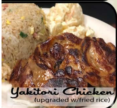
Yakitori Chicken (upgraded w/fried rice)