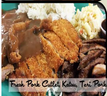
Fresh Pork Cutlet, Katsu, Teri Pork