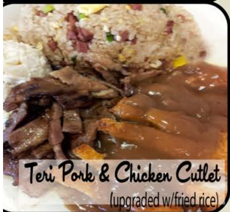
Teri Pork & Chicken Cutlet (upgraded w/fried rice)