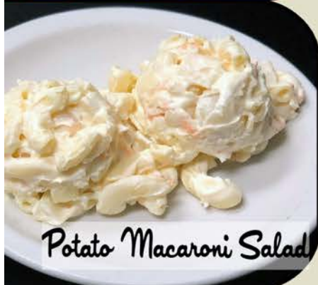
Potato Macaroni Salad