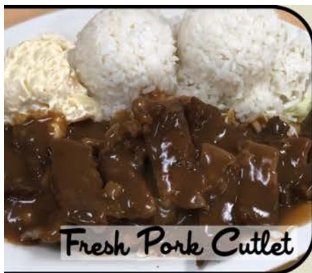
Fresh Pork Cutlet

Mini Plates available on * Entrees for $2.00 less