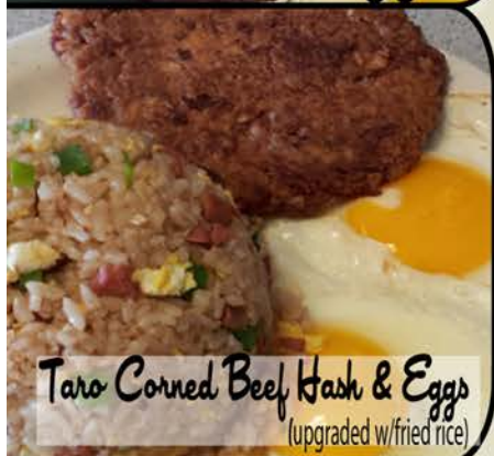
Taro Corned Beef Hash & Eggs (upgraded w/fried rice)