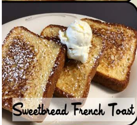
Sweetbread French Toast