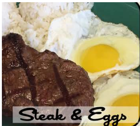
Steak & Eggs