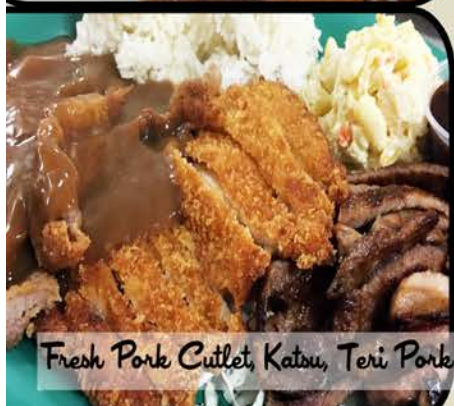
Fresh Pork Cutlet, Katsu, Teri Pork