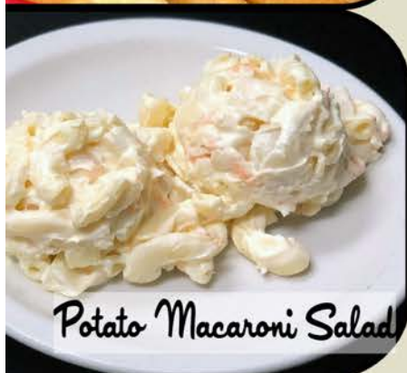
Potato Macaroni Salad