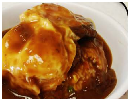
Double Fried Rice Loco